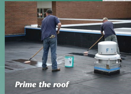
Prime the roof