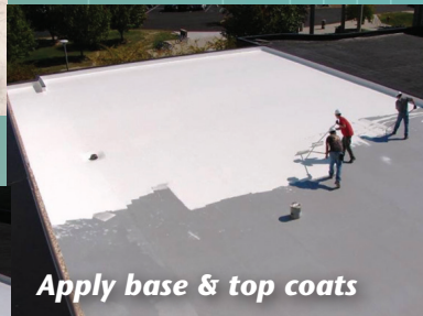
Apply base & top coats