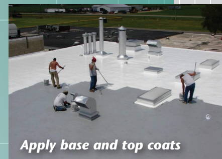
Apply base and top coats