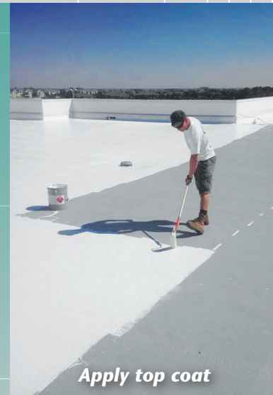
Apply top coat