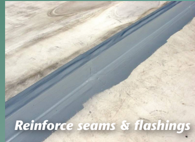
Reinforce seams & flashings