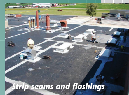
Strip seams and flashings