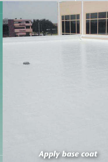
Apply base coat