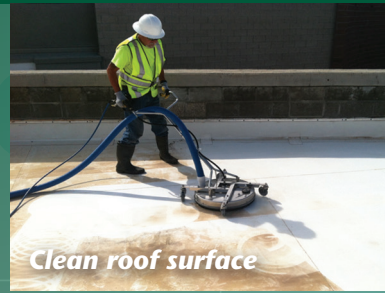
Clean roof surface

Tremco takes responsibility for furnishing quality materials and for providing specifications and recommendations for their proper installation. As neither Tremco itself nor its Representatives practice architecture or engineering, Tremco offers no opinion on, and expressly disclaims any responsibility for the soundness of any structure on which its products may be applied. If questions arise as to the soundness of a structure or its ability to support a planned installation properly, the Owner should obtain opinions of competent structural engineers before proceeding. Tremco accepts no liability for any structural failure or for resultant damages, and no Tremco Representative is authorized to vary this disclaimer.