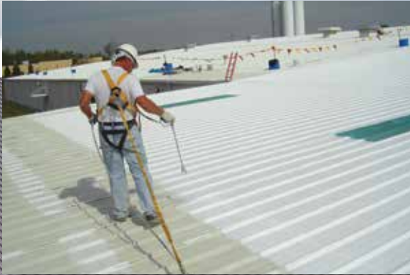
Crane Fencing, Mason, Ohio ( In-progress view; product: SOLARGARD® Hy-Build )