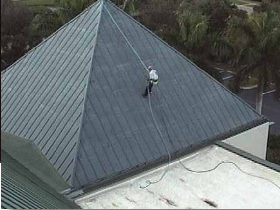
Naples Philharmonic, Naples, Florida (In-progress view)

Tremco Incorporated has been a leader in manufacturing restoration coatings and systems since 1928.