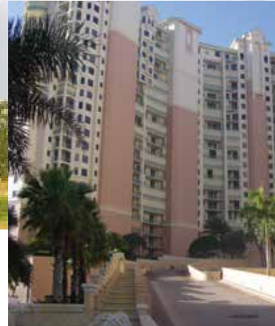
The Belize, Marco Island, FL (product: SOLARGARD® Hy-Build )