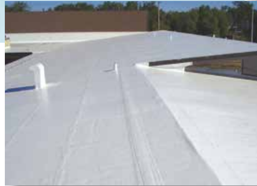
Stevens Point Schools, Stevens Point, Wisconsin (product: GEOGARD®)