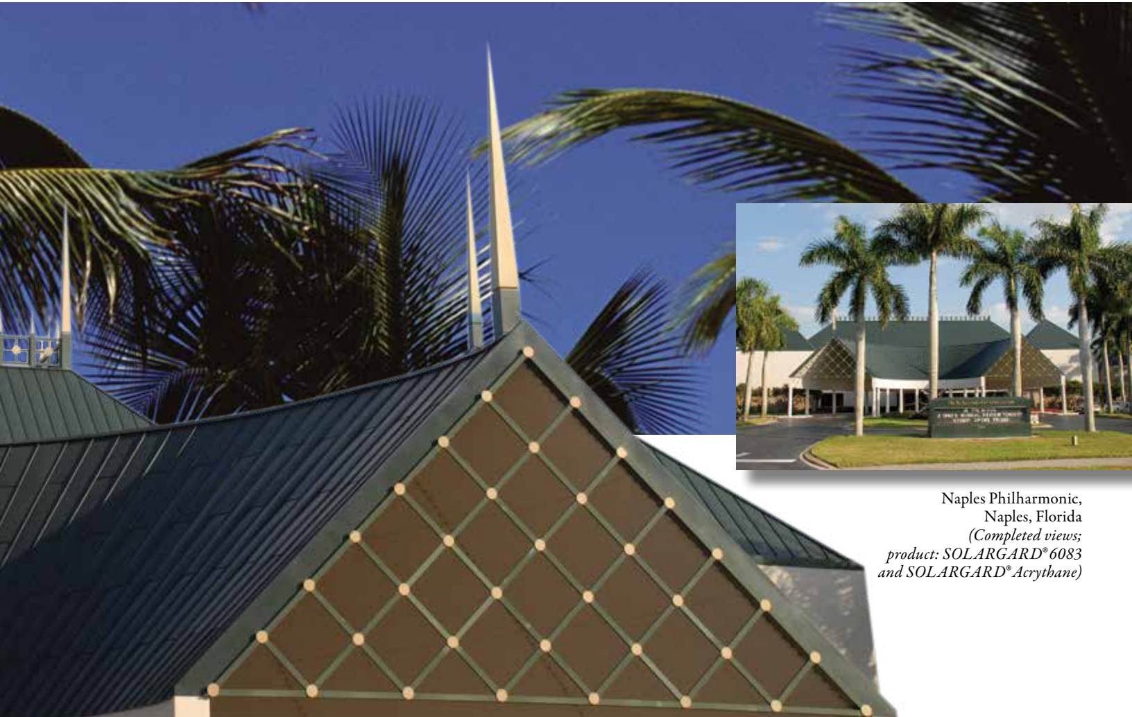
Naples Philharmonic, Naples, Florida (Completed views; product: SOLARGARD® 6083 and SOLARGARD® Acrythane)