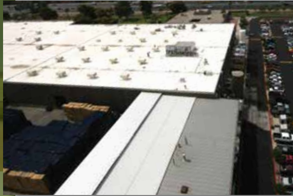
Pepsi, Phoenix, Arizona (product: GEOGARD® )

There's an ENERGY STAR®- qualified restoration system for every kind of roof, which can mean substantial energy savings.