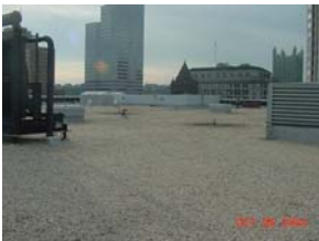
Mellon Bank Client Service Center