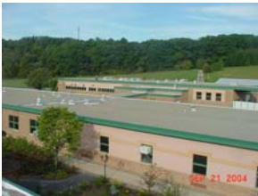
Slippery Rock Area High School