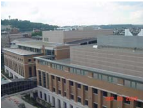
UPMC Hillman Cancer Center