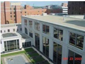
UPMC Shadyside Posner Tower