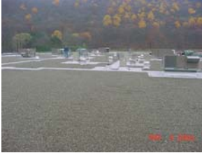
NW Savings Bank Operations Center

Less Leaks – Longer Roof Life – Roofs and Building Envelope Managed!