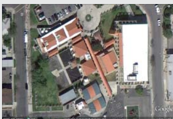
Garfield Elementary School Santa Ana USD