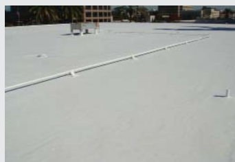
Central Library City of Anaheim