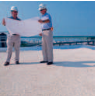
A one-of-a-kind, solvent-based white adhesive, Tremco's Rock-It Surfacing System offers superior UV and chemical resistance.