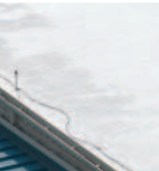
Tremco's nonasphaltic POWERply™T24 – the industry's only white modified bitumen adhesive – eliminates black seams and end lap bleed-out.