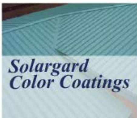
Solargard Color Coatings