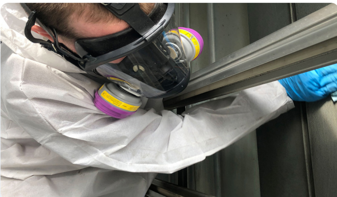
Topically Cleaned by Hand